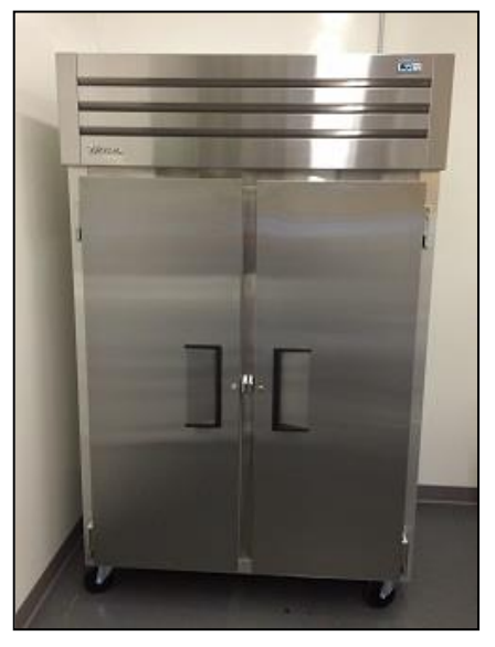
The new fridge – thanks to all who donated.